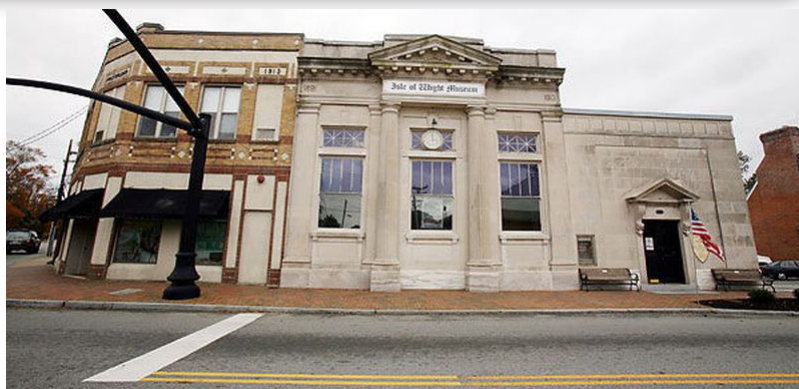
Above, the Isle of Wight Museum in Smithfield, VA. At right, cured in 1902, this is the world's oldest ham. Though it is said to be edible, there aren't any takers!