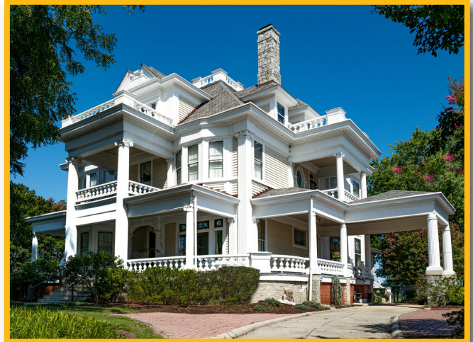
Berryman Mansion, 1902

At 6 p.m. we will hold a Social Hour in the Smithfield Station Main dining room, followed by dinner at 7 p.m.