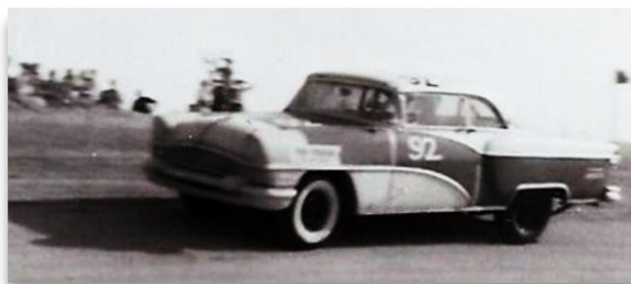
1955 Clipper Constellation raced by Herb Thomas in NASCAR