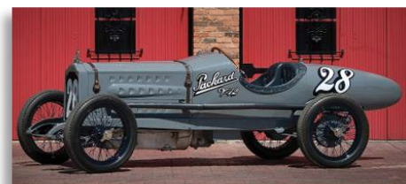
1916 Packard Twin Six Racer. A similar car driven by Ralph DePalma hit 104 mph.