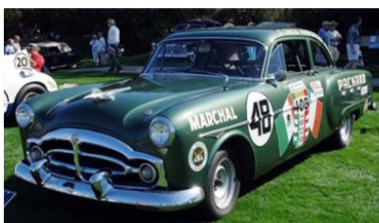
1951 Packard 200 in the La Carrera Panamericana