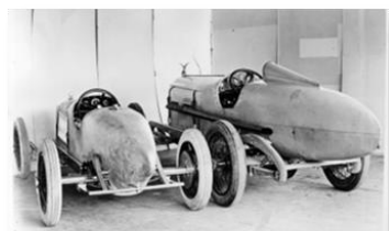
1923 and 1919 Packard race cars