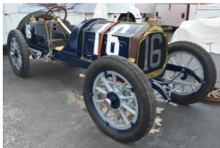
1912 Packard Six Model 48. This car is thought to be the oldest surviving Packard race car in existence.