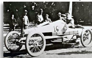
1903 Packard Gray Wolf, Packard's first race car