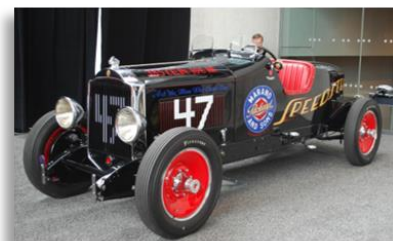
1929 Packard 626 Speedster Race Car