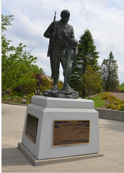
Above, a statue honors the Bedford soldiers killed in Operation Overlord.