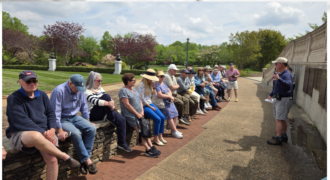
Above right, ODPC members listen to a Memorial volunteer talk about the Allied countries that participated at D-Day. Right, a relief of U.S. soldiers scaling the cliff at Omaha Beach. Below right, a statue of Supreme Allied Commander Gen. Dwight Eisenhower stands inside a small rotunda. Below left, a diorama shows a landing craft, "Czech hedgehog" tank barriers, and GIs moving off the beach.