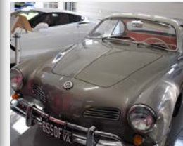
A Mustang (bottom left), a Volkswagen VW Karmen Ghia (bottom right)