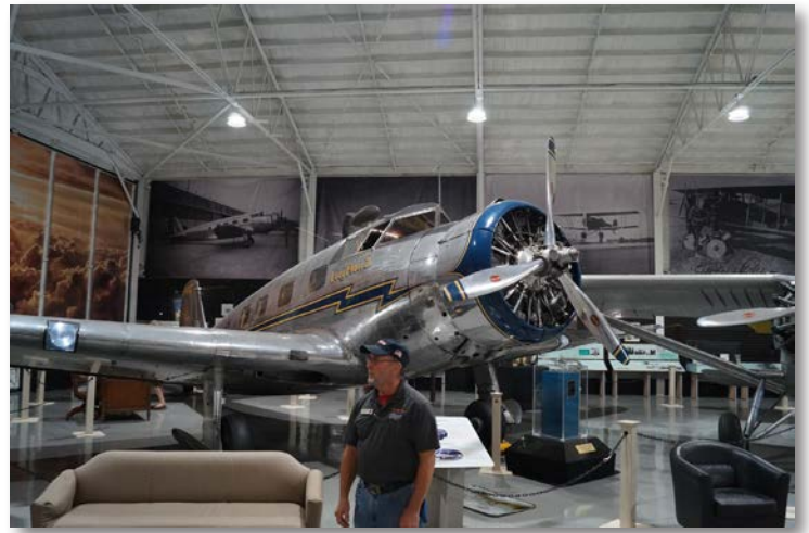
A museum curator talks about the 1936 Vultee V-1AD, which is the only one in existence. This large, single-engine plane was owned by newspaper tycoon William Randolph Hearst.