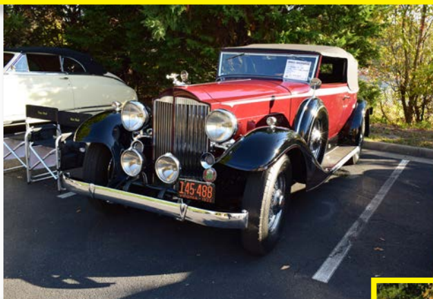
Ron Pack's 1933 Super Eight Victoria top point winner at 99 (above.)