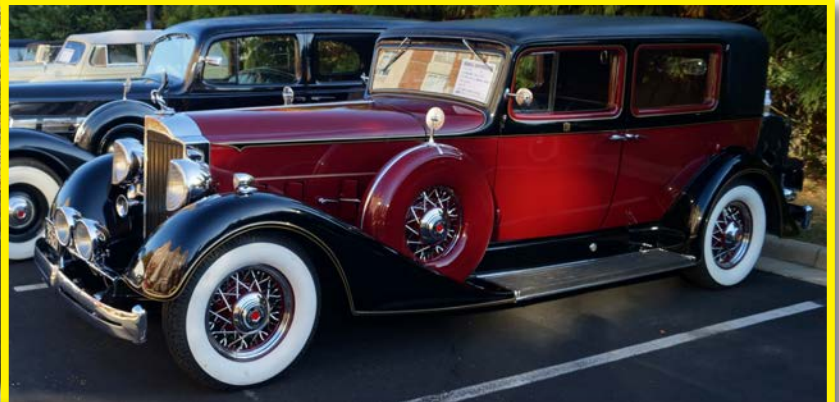
Lynn Shirey's 1934 Super Eight sedan was the Ladies Choice winner (top right)