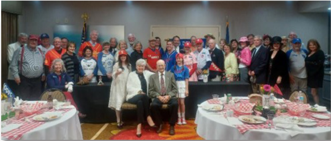
Group shot of ODPC members