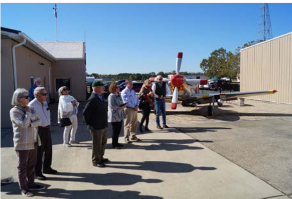
ODPC members get ready to tour the museum, right