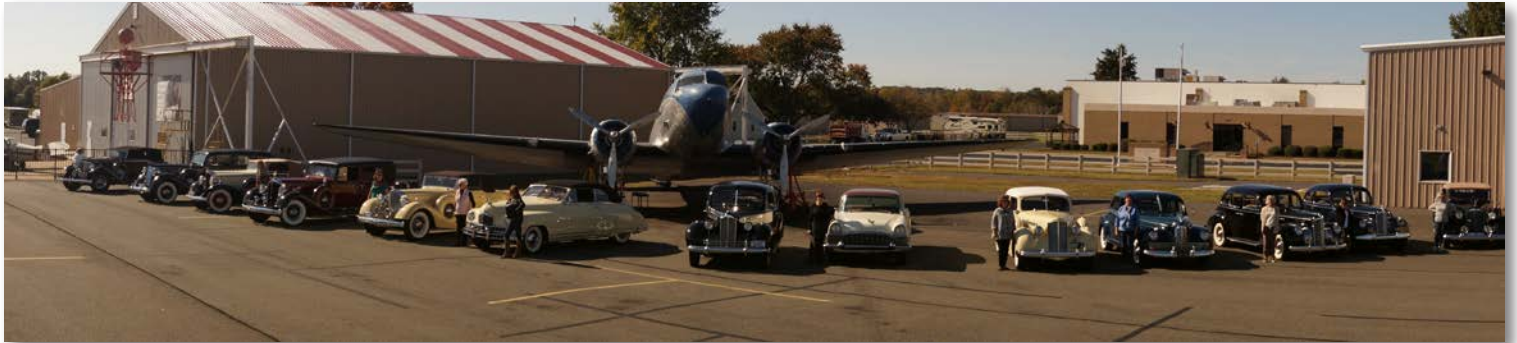
ODPC members line up their cars in front of a DC-3 airplane at the Shannon Airport.