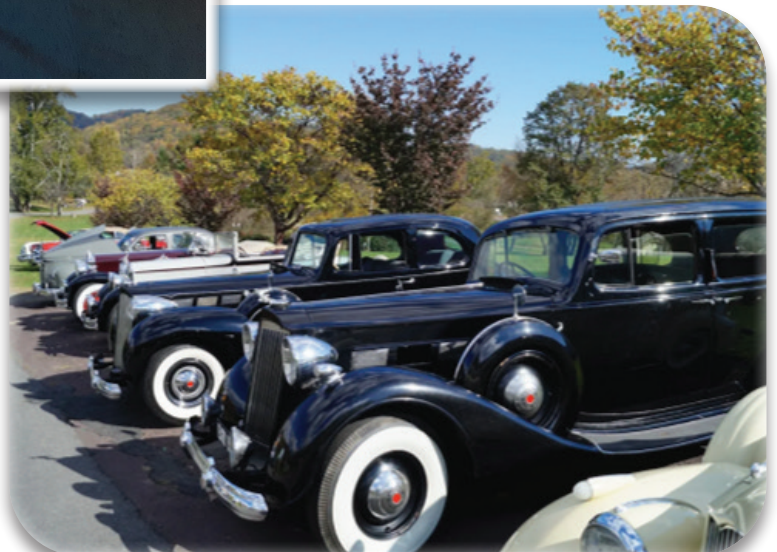
Front to back, 1939 convertible sedan, 1937 Super 8 limousine, 1935 5-passenger coupe, 1931 833 convertible coupe, 1930, roadster, 1946 Clipper