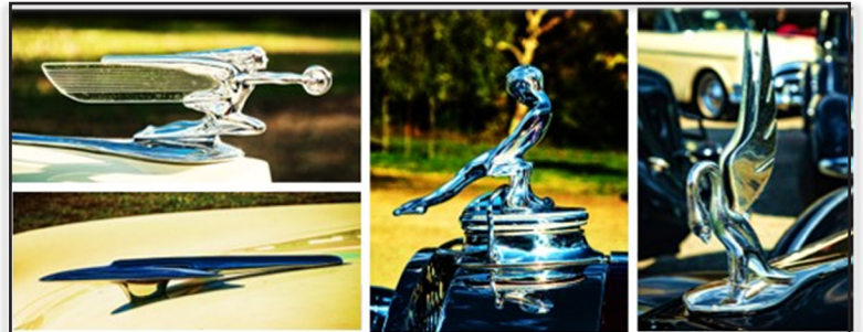
Packard Hood Ornaments

From left, 1939 convertible sedan; 1930 roadster; 1935 5-passenger coupe; bottom left, 1954 Clipper Panama