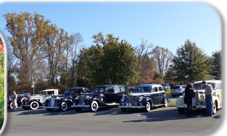
Old Dominion Packard Club cars parked at Montpelier