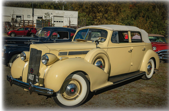
Jim Ridenour's 1939 convertible sedan