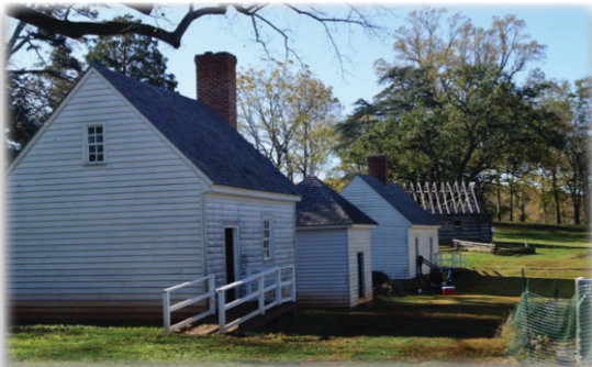
Left, reconstructed slave quarters at Montpelier