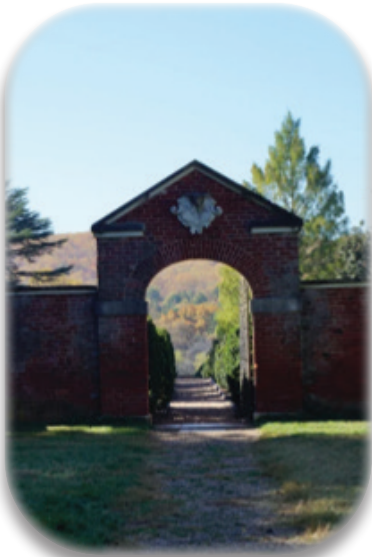
Arched gate at Montpelier