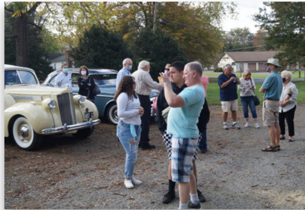
Left, ODPC members arrive at the museum

members had lunch at the Exchange Barbecue across the street from the Museum.