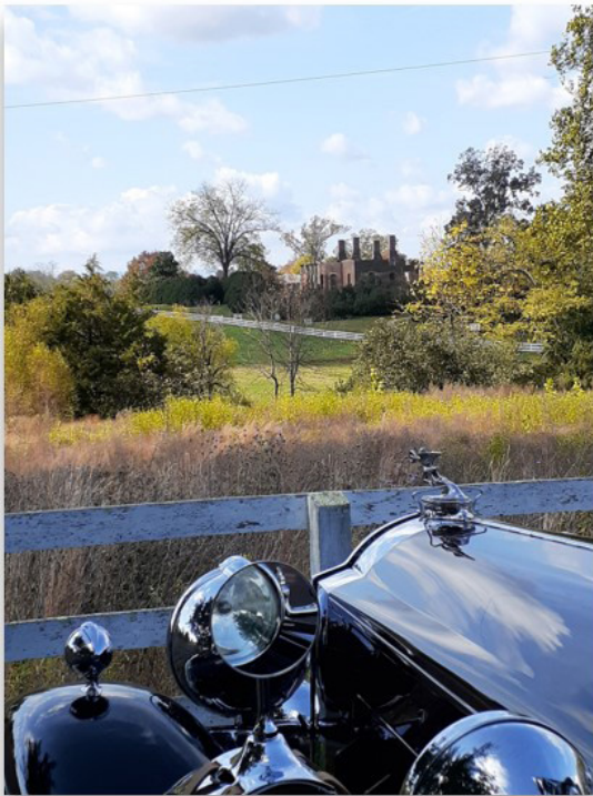
Left, view of Barboursville ruins from the winery

After leaving Gordonsville, we drove to Barboursville, located at the junction of Albemarle, Orange, and Greene counties. We sampled wines at Barboursville Vineyards and saw the ruins of the mansion built by Virginia Gov. James Barbour, which burned on Christmas Day 1884. This mansion had been designed by Thomas Jefferson and built in 1822.