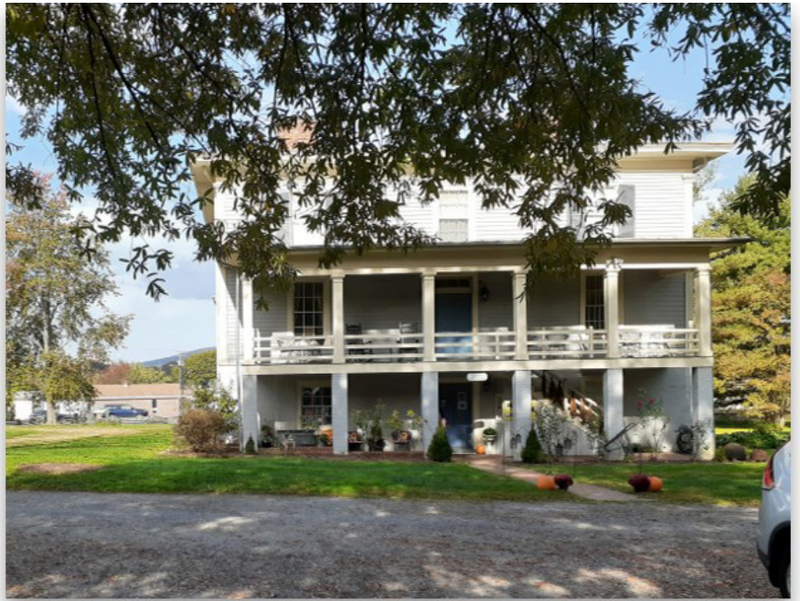
Above, the Exchange Hotel Museum in Gordonsville