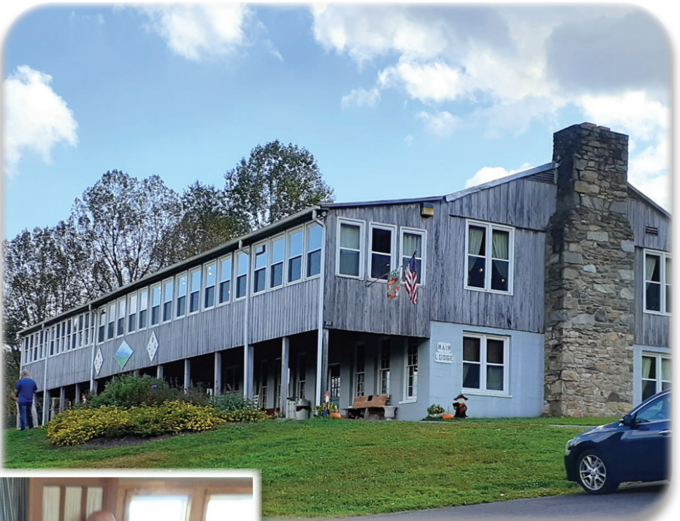
Grave's Mountain Inn, where ODP members had lunch after visiting Montpelier